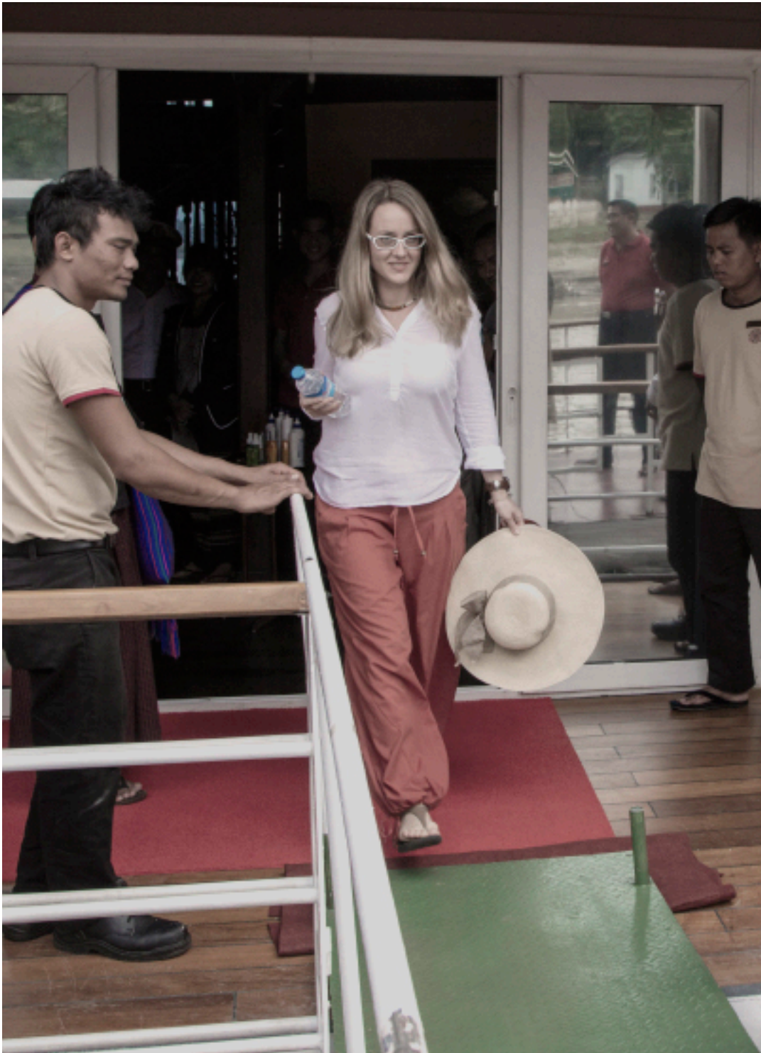
AYEYARWADY - CHINDWIN